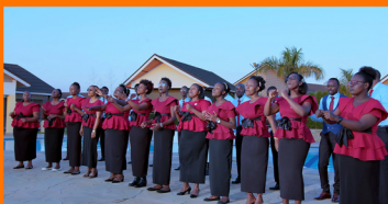
Camp Meeting Guest Choir